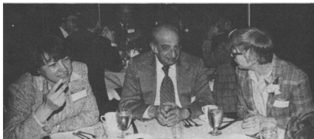
Additional views of audience at February Northeast Section meeting.